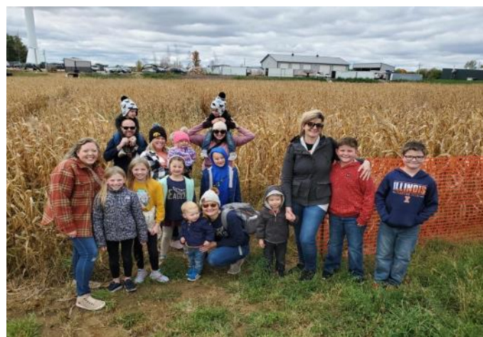
AUMC Families attending Skinner's Corn Maze on October 15th.