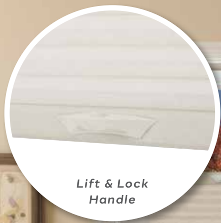
Lift & Lock Handle