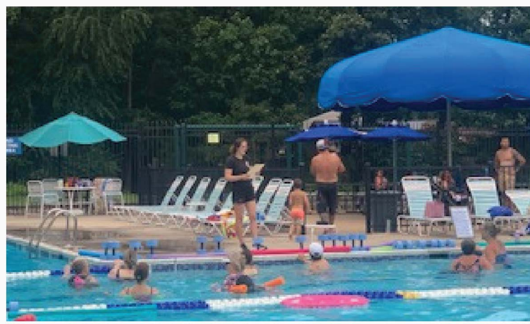
Hiddenbrook residents enjoy a summer water aerobics lesson.