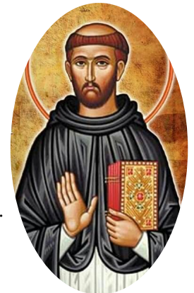
Feast Day: August 8