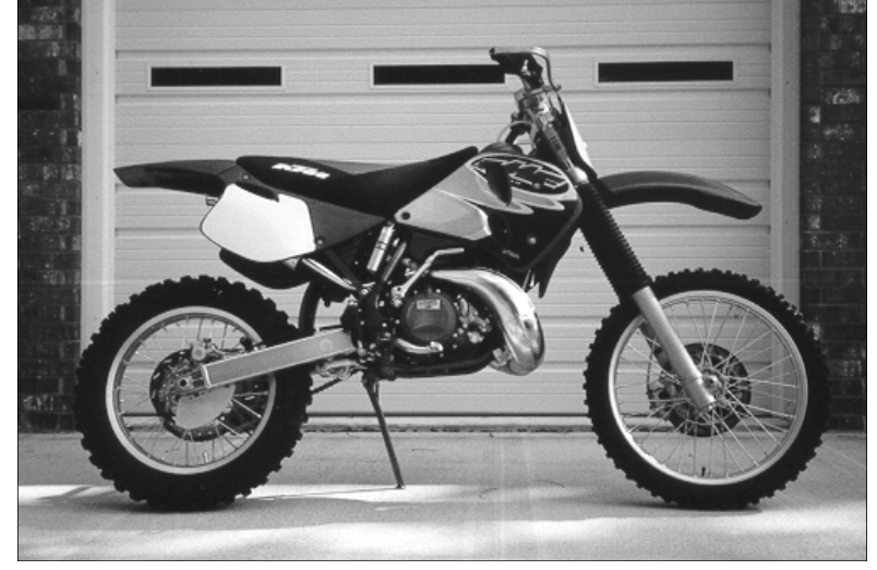
Distraction Number One.

A few things have conspired against me getting this newsletter out. First off, I got a new bike, a brand new 1997 KTM ECX 250. This is not a bad thing. It just takes time to get it set up. you are wondering why a 97 model, because it is big. Being six foot four, this is something I look