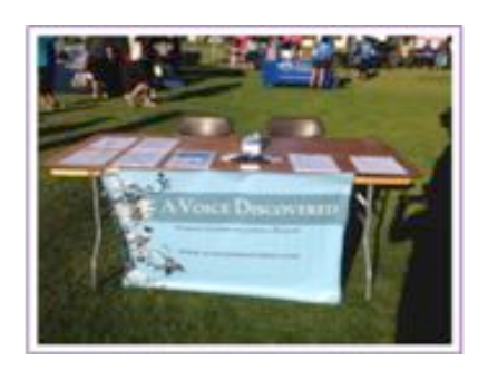
Aut 2 Run Table