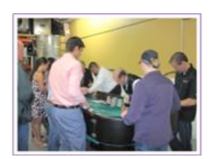
Casino Night Fun!