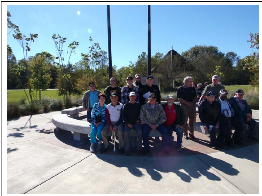
Chapter members seated on the benches after the commemoration of the Dedication of the Louisiana Airborne Memorial Bridge which occurred on October 20 th 1990. After the picture was taken we proceeded to Buck and Johnny's restaurant In Breaux Bridge, LA where we enjoyed a great lunch and visiting with each other.