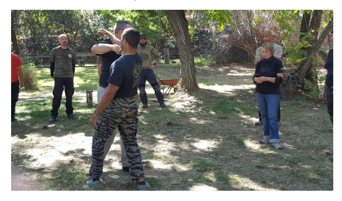
One of the instructors looked up at me, as he was on his back gasping for breath, "GOD, you guys did it again!"

whistle was blown and then they had to create the opportunity to deploy their knives and defeat the attacker. Each student gave the 100% PLUS that is expected at KITW.