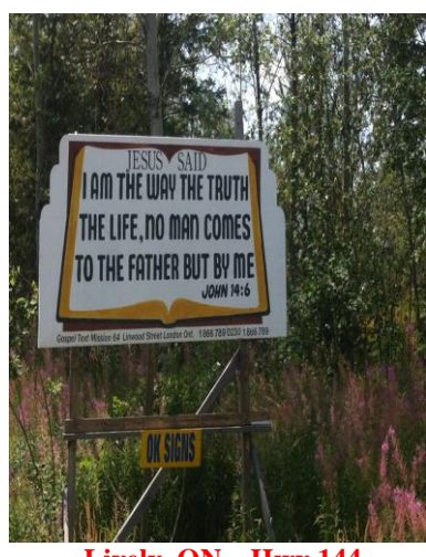
Lively, ON – Hwy 144