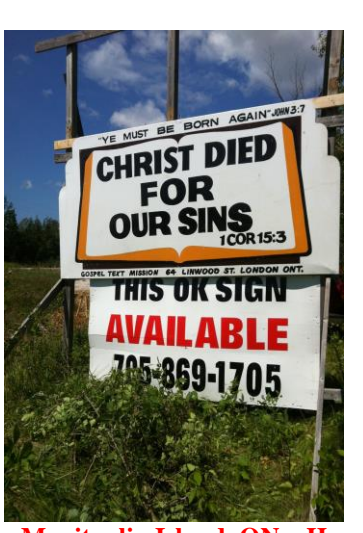
Manitoulin Island, ON – Hwy 6