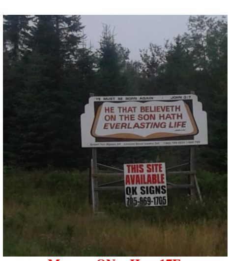
Massey, ON - Hwy 17E