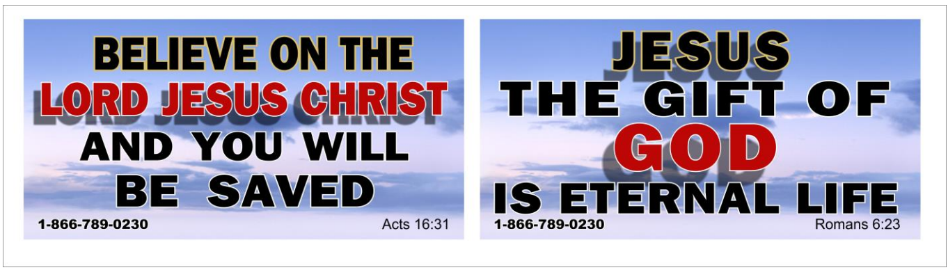
Two rental signs along highway 41 near Roblin, ON placed in a V shape

The Signs below have had their contracts renewed for 2019