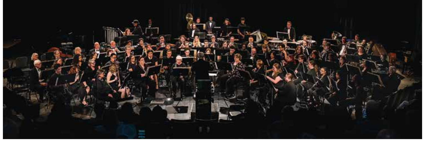
The Racine Concert Band performed at J.I. Case High School on May 25 and were joined by the students for the finale of the concert.

The Racine Concert Band is thrilled to return to the Kiwanis Amphitheater stage at the Racine Zoo to present our 101st season of free concerts this summer. So, pull up your lawn chair or blanket and enjoy our 1512th - 1518th free concerts against the backdrop of beautiful Lake Michigan.