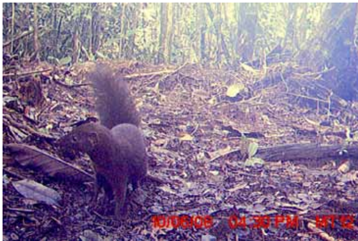
Fig. 2. Brown-tailed Vontsira Salanoia concolor , Makira Natural Park, Madagascar, 6 October 2008.