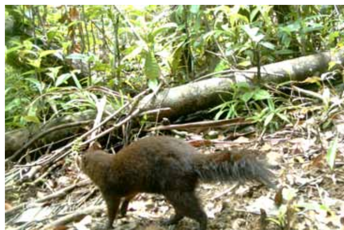
Fig. 4. Brown-tailed Vontsira Salanoia concolor just outside the Makira Natural Park, near the village of Sahavary. (Left) a duo in highly degraded forest, 17 January 2011; (right) a single in highly degraded forest on 19 January 2011.

negative relationship with G. elegans occupancy (Gerber et al. 2010, 2011, 2012a, 2012b). Additional camera-trapping surveys in Makira also showed higher introduced carnivore and human capture rates in fragmented and degraded forests, and negative correlations between endemic carnivore and human capture rates, as well as between endemic carnivore and introduced carnivore capture rates (Farris & Kelly 2011). The records near Sahavary and Andongana indicate, however, that S. concolor can sometimes occupy human-altered forest habitat. The apparent negative relationships between S. concolor and dogs, cats and humans give serious concerns about long-term protection and management of this species within a human-altered landscape in which human-wildlife conflicts are mounting. Managers should consider the implementation of a trapping and removal programme for cats and dogs throughout these forest sites.