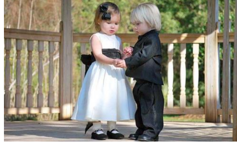
Lot 27 – Formal Wear