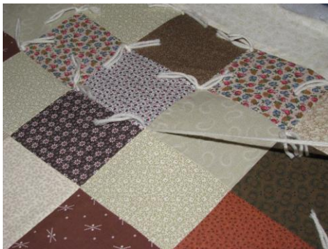
Lot 32 – Tied