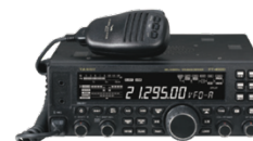
FT-450D A100W HF + 6M Transceiver