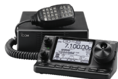
IC-7100 All Mode Transceiver