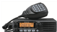
TM-281A 2 Mtr Mobile