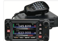
FTM-400XD 2M/440 Mobile