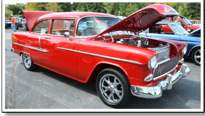
See our Facebook Page for MORE Photos!