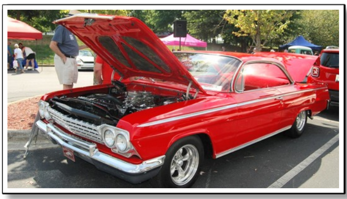
See our Facebook Page for MORE Photos!