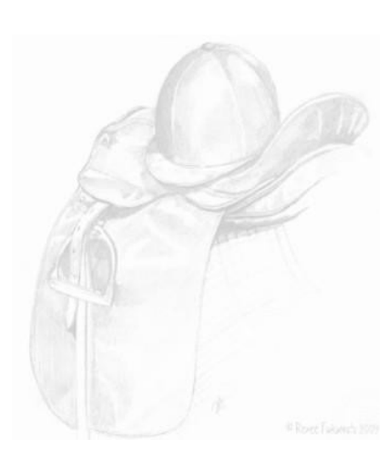
USEF MEMBERSHIP STATEMENT

Life, senior active and junior active members shall be eligible to participate in all classes at Regular Competitions, Eventing Competitions at the Modified Level or above and Combined Driving Competitions at the Advanced Level, Dressage, Reining and Vaulting Competitions and Endurance Rides. A nonmember may participate as a handler, rider, driver, owner, lessee, agent, coach or trainer at Regular Competitions, Eventing Competitions, Dressage Competitions, Reining Competitions and Combined Driving Competitions upon payment of a $45 Show Pass fee. Participants in the following classes are exempted from the Requirements of this rule: 1) leadline; 2) exhibitions; 3) games and races; 4) classes for 4-H members; 5) walk trot (exception: Friesian performance FR222) and academy classes (academy classes are classes limited to horses used regularly in a lesson program); 6) USDF introductory level tests, pas de deux and quadrille classes; 7) NRHA Endorsed Reining Competitions. 8) Opportunity classes, 9) citizens of other nations who have proof, in English, of current membership in good standing of their own National Federation, 10) USEA beginner novice division; and 11) assistant handlers in Dressage Sport Horse Breeding classes.