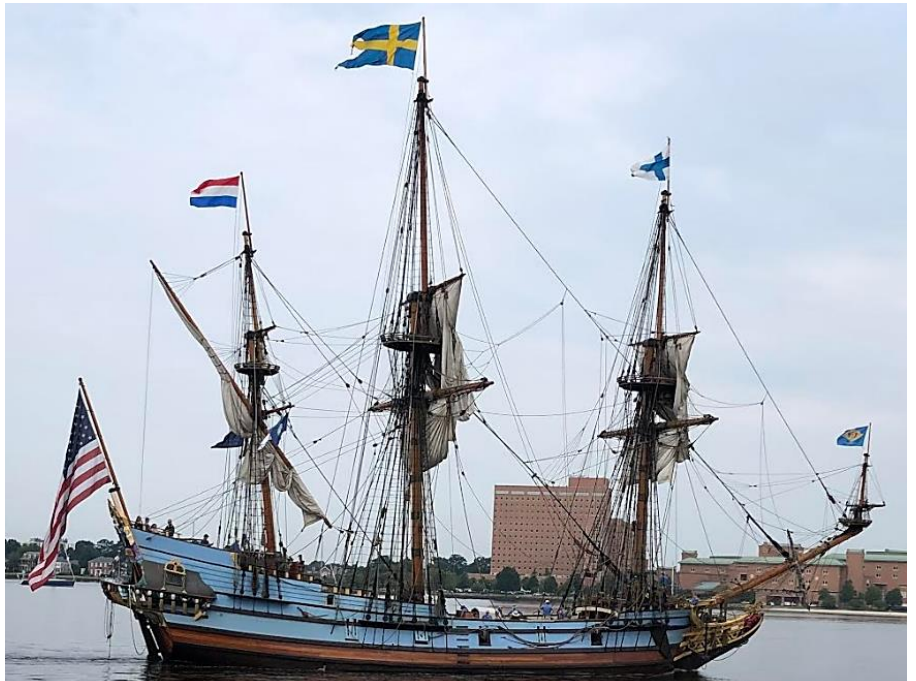
One of the tall ships that participated in 2022: Kalmar Nyckel; Wilmington, DE (LOA: 93'; Beam: 12'11"; Draft: 12'5"; Rig Height: 105')

Come see the Tall Ships by land and by sea, but you better hurry and sign up now or the Harbor Cruise Boat may leave the dock without you! Act now and join us! You MUST RESERVE your seat IN ADVANCE! SIGN UP NOW!