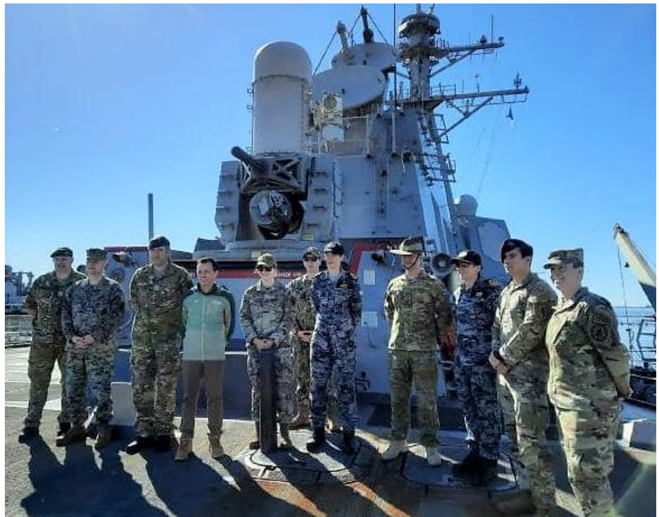
On March 14, members of the Joint Forces Staff College had the opportunity to take a tour of USS GRAVELY.