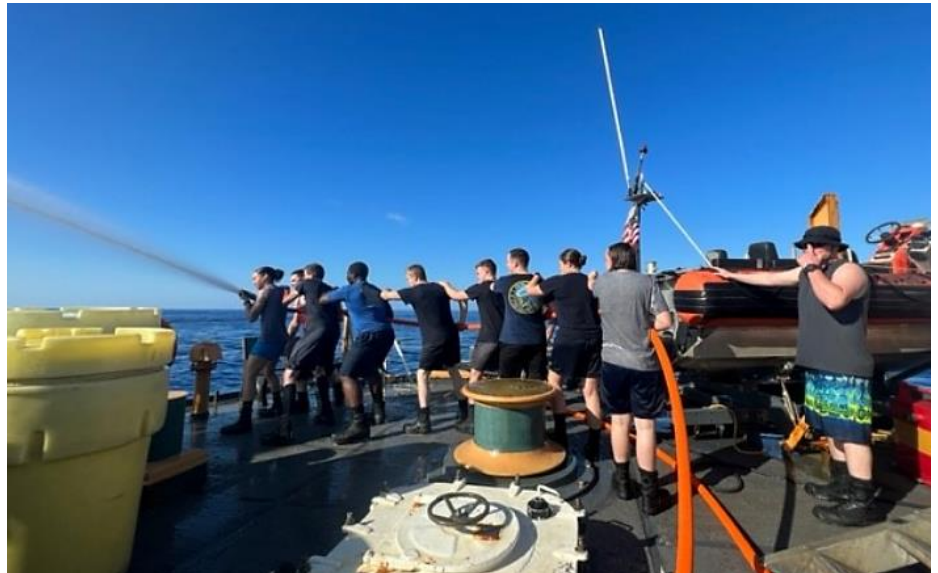
Northland crewmembers practice fire hose operations during Northland's damage control Olympics

During breaks in the action, NORTHLAND crew have been busy conducting training and drills for our new crewmembers. NORTHLAND's Damage Controlmen (DCs) led the crew through "Damage Control Olympics," a multi-event training where teams competed against one another and put their damage control knowledge to the test, by plugging and patching pipes on the wet trainer, practicing fire hose handling, and rigging and running ventilation to remove fumes from a space. Despite