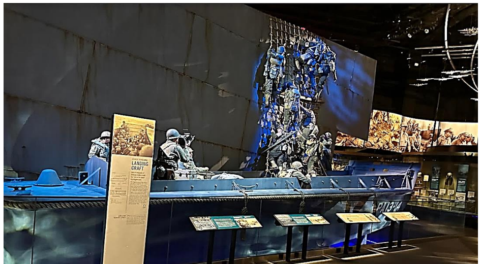
The Global War Gallery portrays the Army's role in the Allied victory during WWII. Tens of thousands of American Soldiers made the "run to the beach" in a Higgins boat.