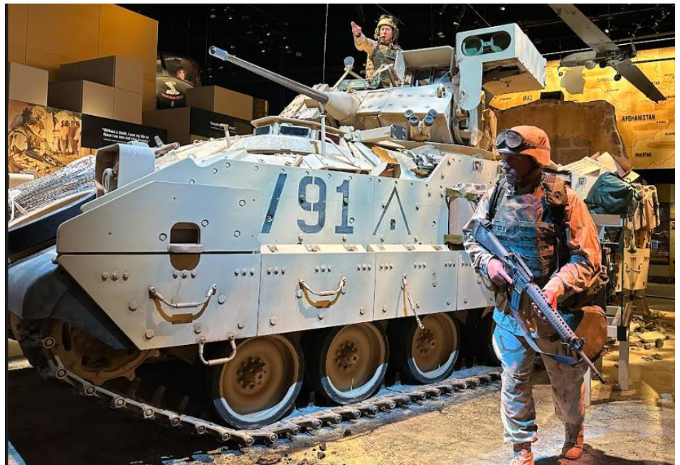
The Changing World Gallery chronicles one of the most dynamic and global periods in U.S. Army history, from the fall of the Soviet Union through our nation's current conflicts.

The Museum has an on-site café and museum store. There is also ample free parking. The Museum is located at 7745 Liberty Drive at Fort Belvoir and is open seven days a week. The operating hours are 9:00 AM to 5:00 PM. The Museum entrance is located outside the gates of Fort Belvoir and Photo ID's are not required. 🗑️