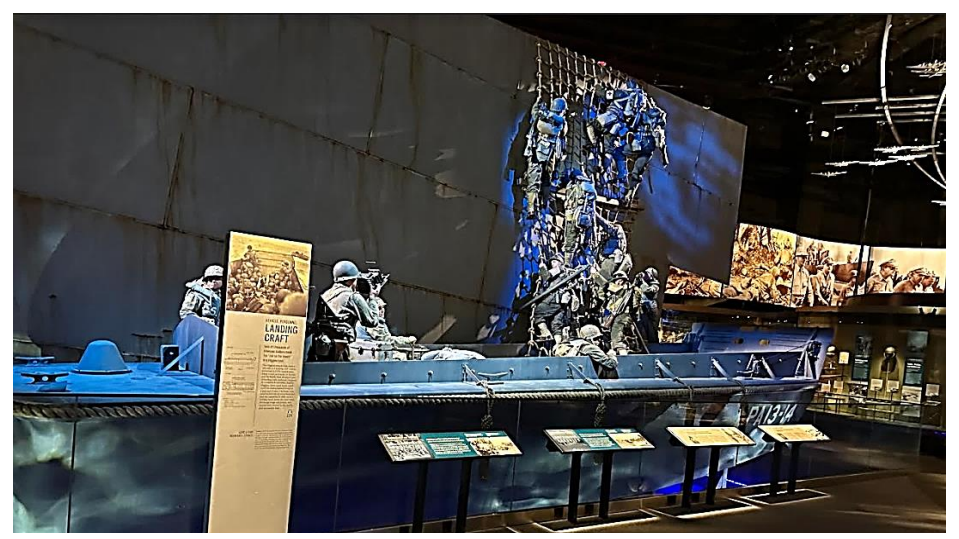
The Global War Gallery portrays the Army's role in the Allied victory during WWII. Tens of thousands of American Soldiers made the "run to the beach" in a Higgins boat.