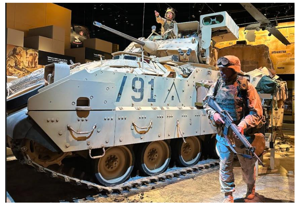
The Changing World Gallery chronicles one of the most dynamic and global periods in U.S. Army history, from the fall of the Soviet Union through our nation's current conflicts.

The Museum has an on-site café and museum store. There is also ample free parking. The Museum is located at 7745 Liberty Drive at Fort Belvoir and is open seven days a week. The operating hours are 9:00 AM to 5:00 PM. The Museum entrance is located outside the gates of Fort Belvoir and Photo ID's are not required.