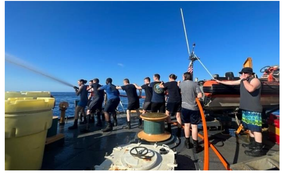
Northland crewmembers practice fire hose operations during Northland's damage control Olympics

During breaks in the action, NORTH- LAND crew have been busy conducting training and drills for our new crewmembers. NORTHLAND's Damage Controlmen (DCs) led the crew through "Damage Control Olympics," a multievent training where teams competed against one another and put their damage control knowledge to the test, by plugging and patching pipes on the wet trainer, practicing fire hose handling, and rigging and running ventilation to remove fumes from a space. Despite