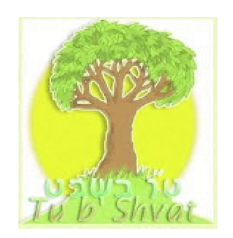
Tu B'Shevat Monday, January 21