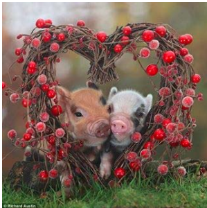
Relatives of Bacon Van Lean our BVL pig