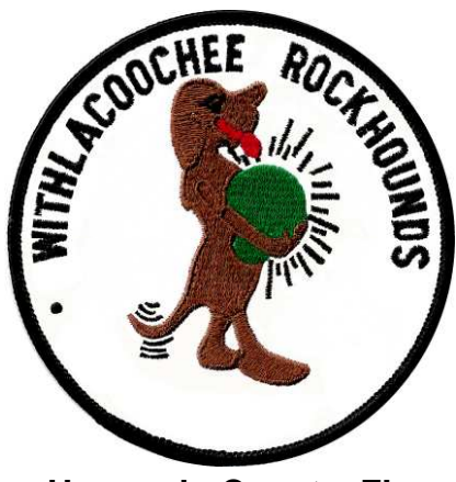
Hernando County, FL