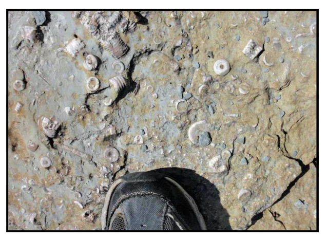
A huge boulder filled with crinoids.