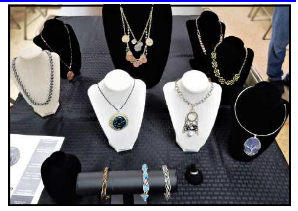
Examples of projects made by the Tuesday morning workshop students.