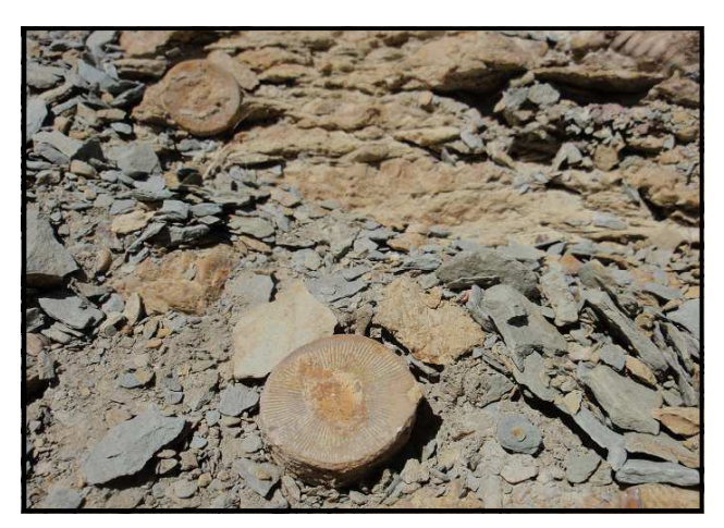
Crinoids for the picking.

This section of road, where limestone knobs (steep knobby hills) were cut though, stretches for a few miles. About twenty years ago while checking out these ledges, the only area where crinoids could be found is a small section on one side of the road, about three hundred feet in length. Apparently conditions were just right, hundreds of million years ago, for crinoids to live, die, and become preserved as fossils.