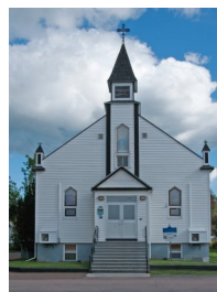
Our Lady of Mercy 11 St. Andrews Street Pointe-du-Chêne, NB