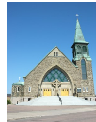
Saint Augustine's 340 Dominion Street Moncton, NB

July 7th, 2019 Fourteenth Sunday in Ordinary time