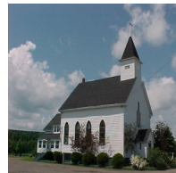
Saint Lawrence O'Toole 2340 Route 115 Irishtown, NB