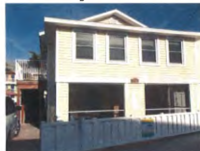
Image of Structure