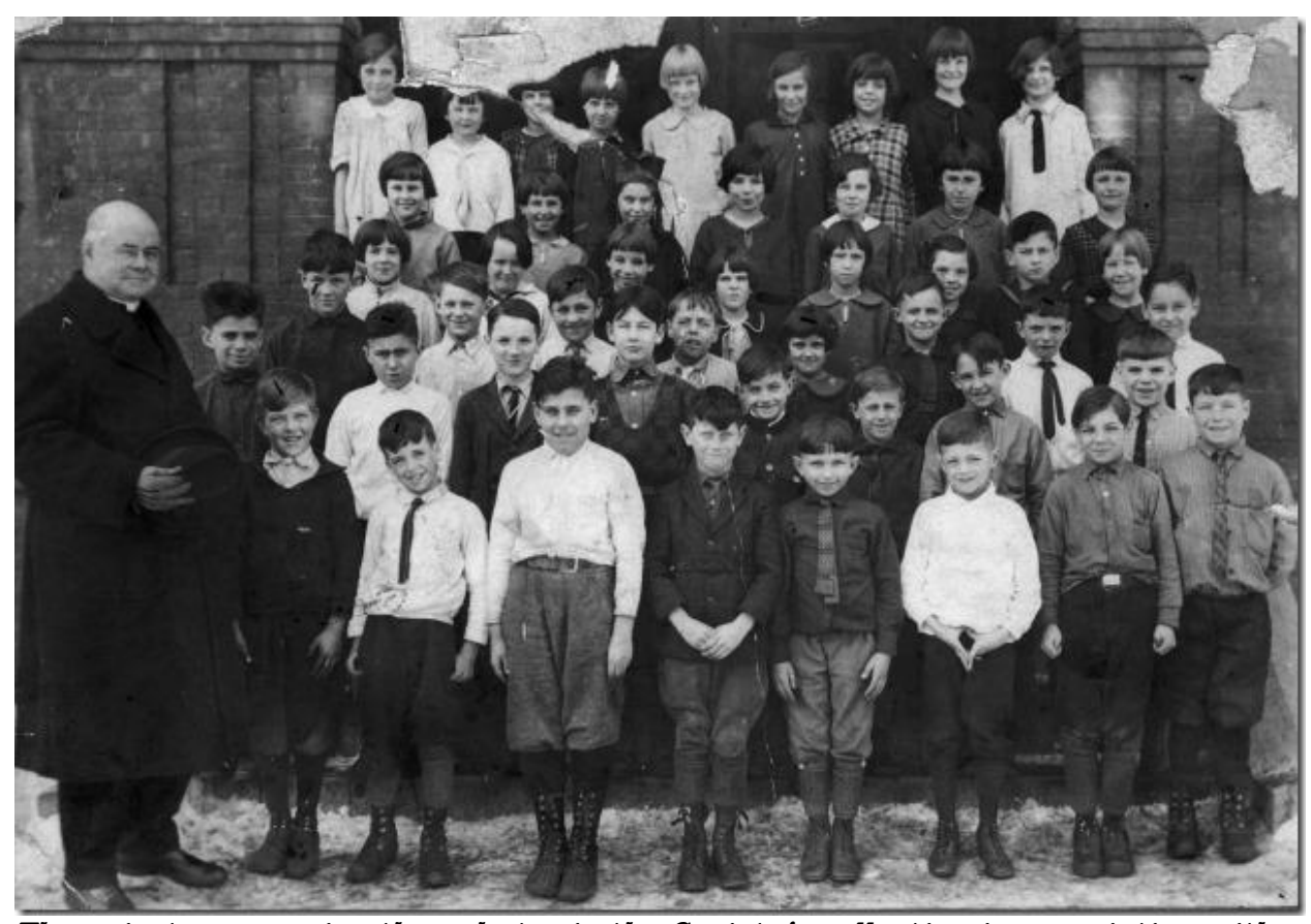
The priest appears in other photos in the Society's collection in association with St. Mary's School.

June is the month of the Society's Annual Plant Sale. Pre-orders are encouraged, as per the information below. Don't miss out!