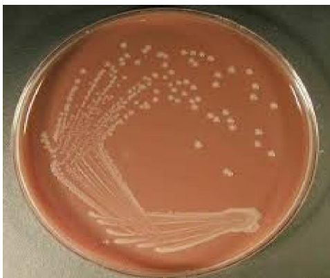
Figure2: Colonies of haemophilus on chocolate agar

Microscopic examination: gram stain Haemophilus species are small coccobacilli or longer rod-shaped Gram negative cells, variable in length with marked pleomorphism and sometimes forming filaments. (Quinn, et al. , 1994).