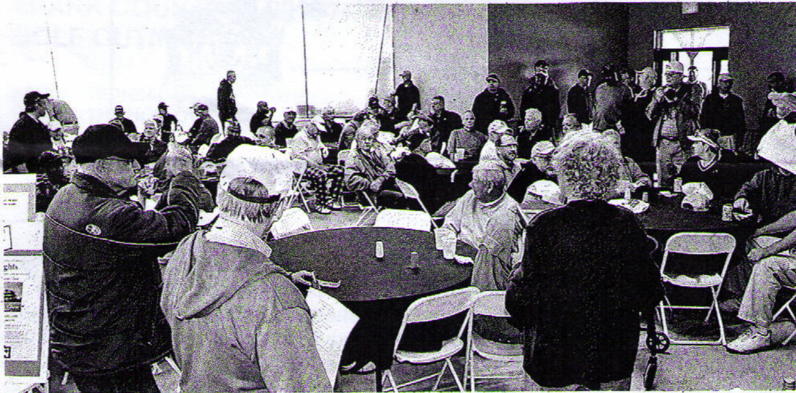
Drawings for prizes proved to be popular again this year