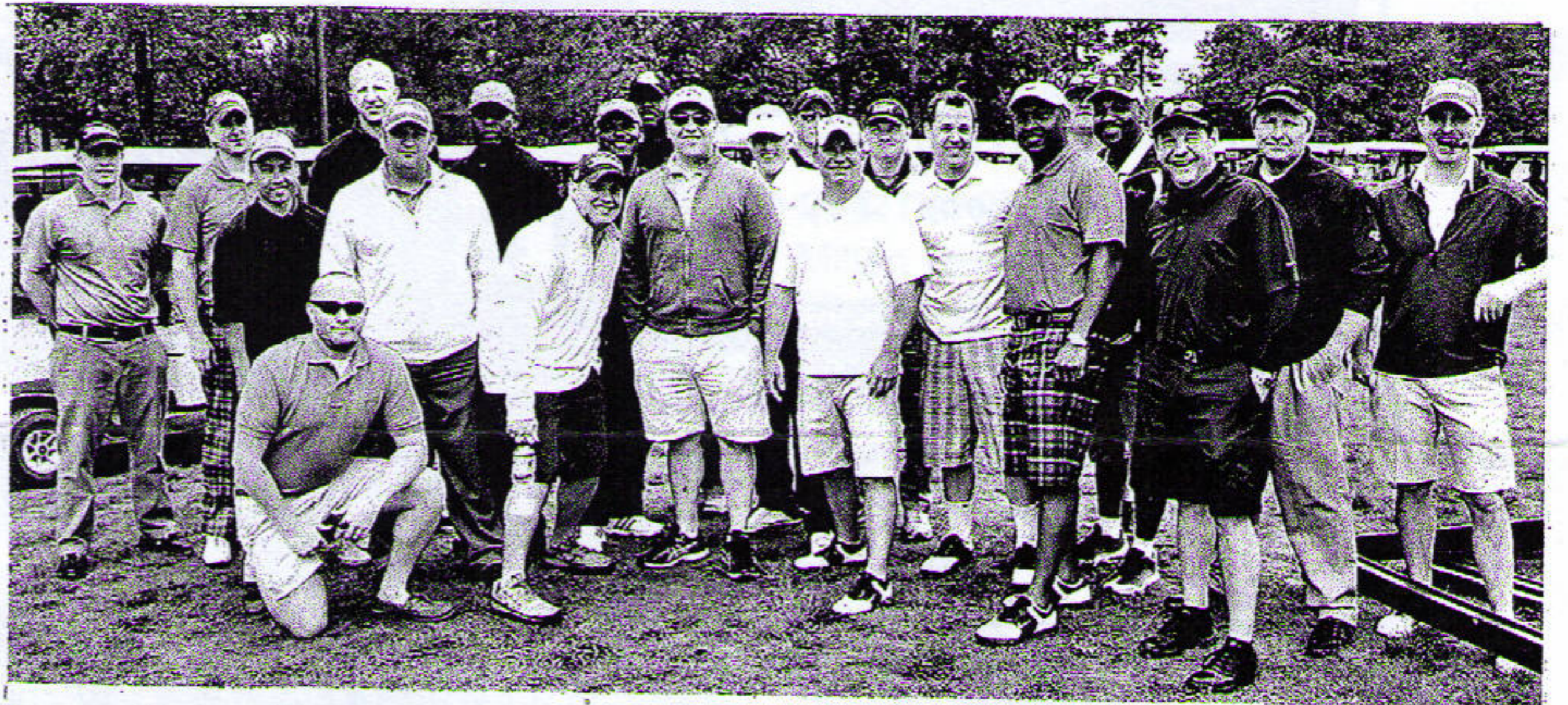
Council greatly appreciated this kind of support from these golfers from Navy Recruiting District Richmond

After all the score cards were tallied, the first place honors went to the Navy Recruiting District Richmond.