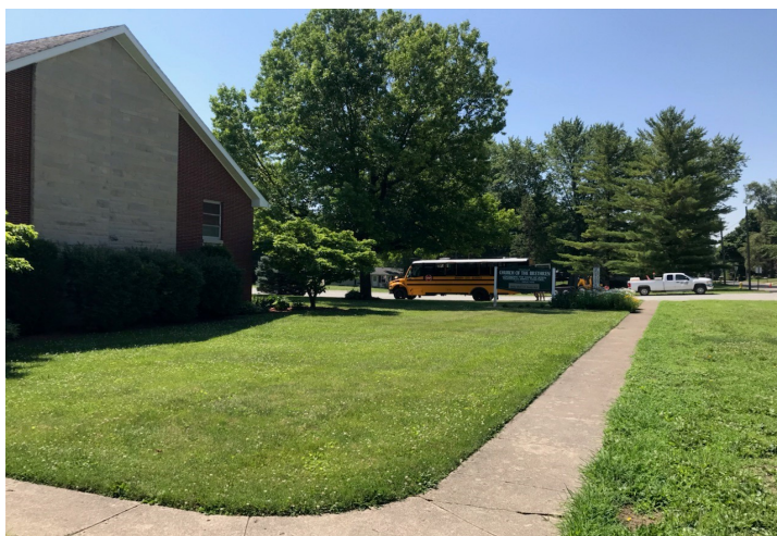
Wabash City Schools delivering lunches

We welcome all who are on the journey to know Jesus, who share in his love and who choose to embrace the diversity within this community of believers. As individuals we may be at different places along the path, but as a community, we are all traveling together in faith, trusting God to show us the way.