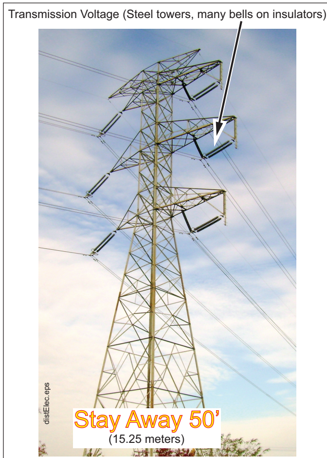
Figure 2. Stay 50 feet away from these wires.

There are situations where, with proper preplanning with the owner of the power utility and others on the job, cranes are allowed to decrease the above distances. Experience has taught us that pump operators are rarely, if ever, included in those preplanned meetings. Accordingly, the ACPA believes that publishing only the 20 foot rule and the 50 foot rule will maximize safety for pump operators and others near the pump.