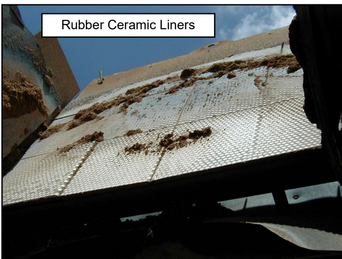
Rubber Ceramic Liners

Combine these products with our rubber, urethane and wire screen media which are designed to reduce blinding, pegging, wear and maintenance.