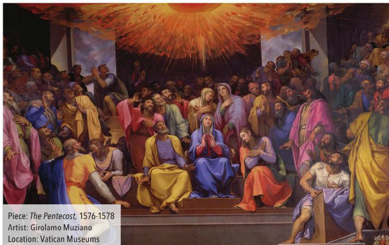
Piece: The Pentecost, 1576-1578 Artist: Girolamo Muziano Location: Vatican Museums

Jesus declared to the apostles at the Last Supper that the Holy Spirit would remind them of all he told them. Jesus gave this gift to the Church, and it's something we should value. How often do we do an internet search about a subject and then trust what a few articles say? Yet, are we as quick to look up what the Holy Father and the bishops say on different subjects in order to be guided by that light?