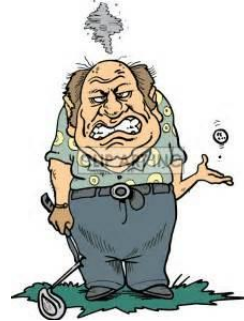
Look what they're doing to my golf game!

This is the second of a two part report on some real craziness that's coming out of this administration and the democrats in congress. In Part One, I introduced the facts as I understand them, provided some liberal politicians' and administration comments, and threw in a little personal commentary. In this report I will continue my commentary and focus more on some opposition reaction.