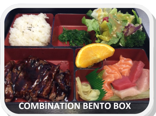
COMBINATION BENTO BOX