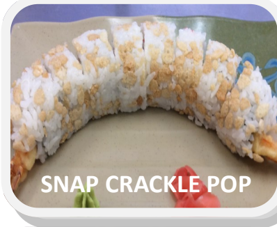
SNAP CRACKLE POP