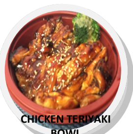
CHICKEN TERIYAKI BOWL