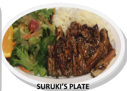
SURUKI'S PLATE CHICKEN TERIYAKI