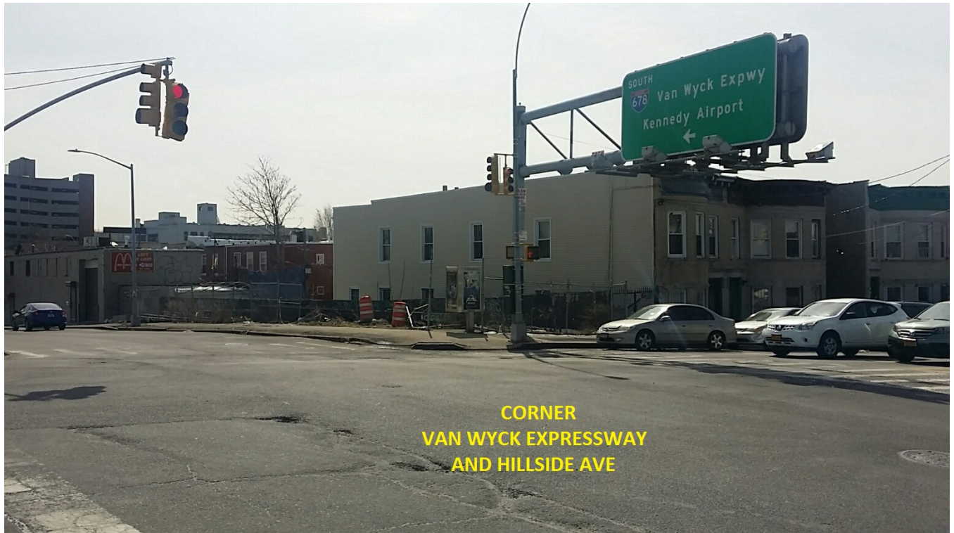
CORNER VAN WYCK EXPRESSWAY AND HILLSIDE AVE