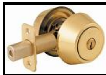
Figure 3 – Examples of Deadbolts which, if activated whilst the door was open, would prevent the door from latching.