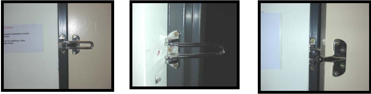
Figure 4 – Example of Security Device which, if activated whilst the door was open, would prevent the door from latching.

A simple test for compliance is to hold the door open, activate any locking / latching / security device and release the door, if the door closes and latches shut, the operation of the device is acceptable. This is achievable when the latch has a chamfered leading edge.