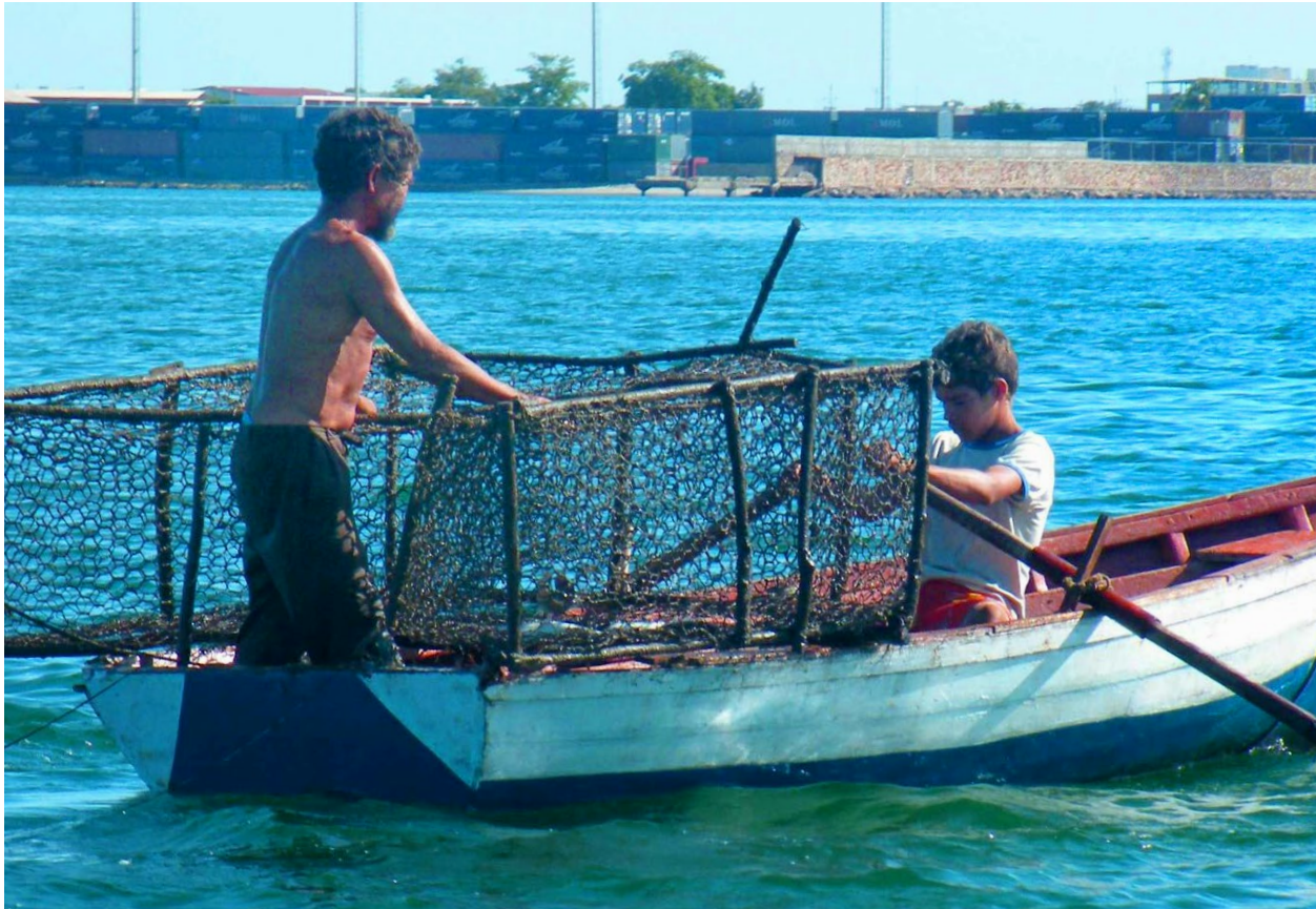
A fisher and his young assistant in Cumaná, Venezuela, location of the 62nd GCFI.

GCFI also hosts the Invasive Lionfish web portal., which is supported by a consortium of academic, government, and NGO organizations. The website features a variety of functions that will enhance the exchange of information related to the invasion, current research and monitoring topics, and the methods of control.