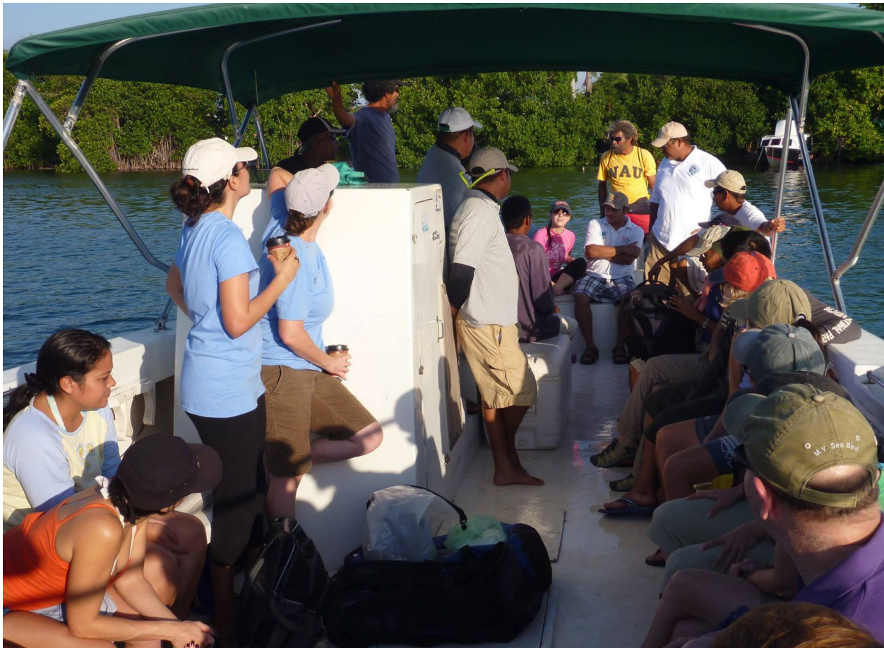
The Mesoamerican Reef (MAR) Leadership Program's 2012 MAR Fellows take part in a field trip to Laughing Bird Caye, Belize.

The GCFI provides guidance and assistance in planning workshops and symposia that occur as