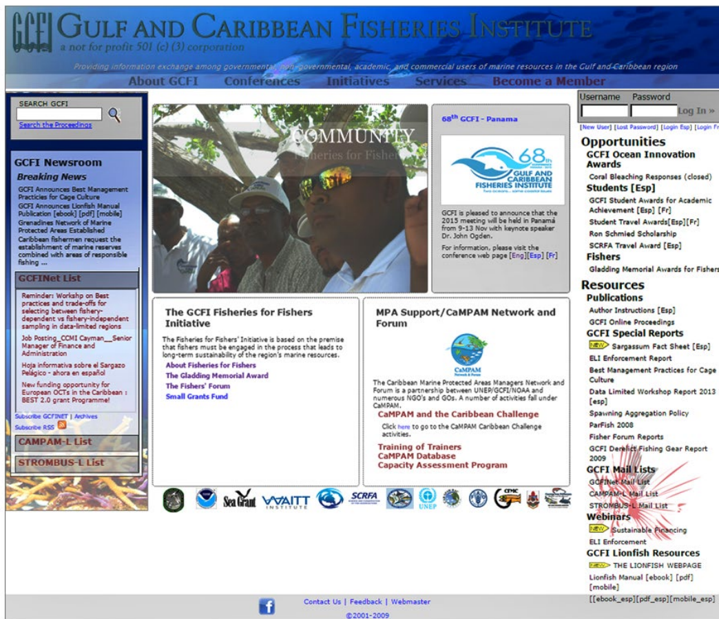
GCFI home page at www.gcfi.org , 2015