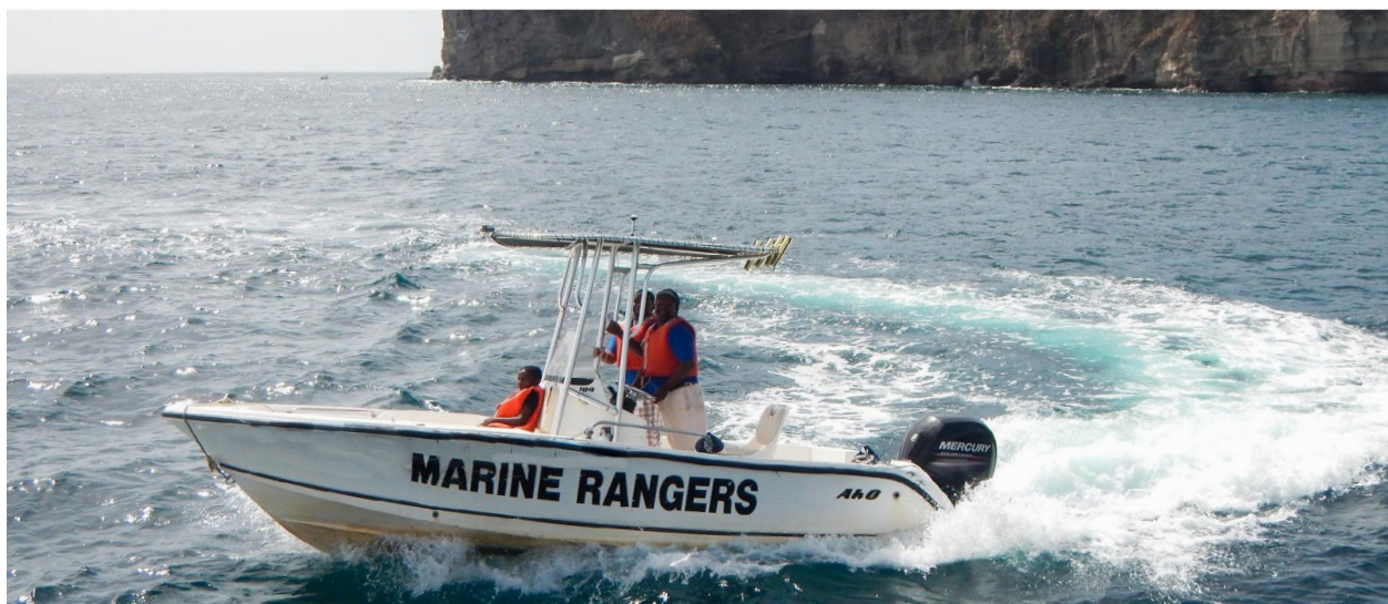
Patrol boat, Soufriere Marine Managed Area, Saint Lucia.

Peer-review journals are vitally important to the scientific process and dissemination of science among members. The GCFI will explore possibilities of creating or partnering with other organizations on a peer-review journal to increase science credibility and communication within GCFI and the region.