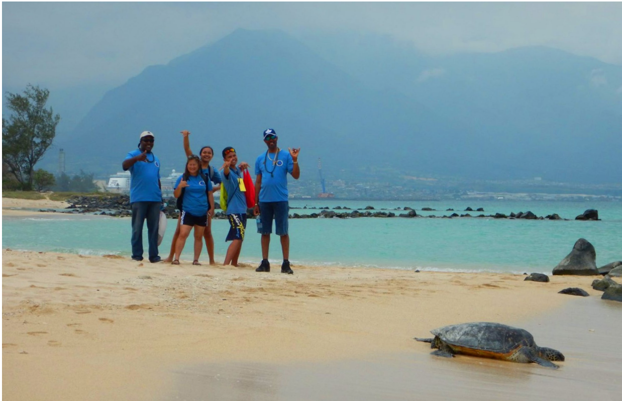
Representatives from The Bahamas National Trust and the Abaco of Fly Fishing Guides Association on a NOAA-sponsored exchange visit to Hawaii to learn about community fisheries enforcement.

interested in ecosystem-based solutions. The same is true of the on-the-ground activities for our capacity-building programs. Through these efforts, GCFI has become a go-to independent reference point for MPA managers in the Caribbean region for technical advice, networking and capacity building and we will work to cement this important role for GCFI.