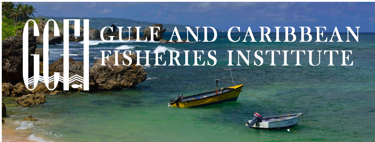
Fishing boats at anchor in Barbados, location of the 67th GCFI.