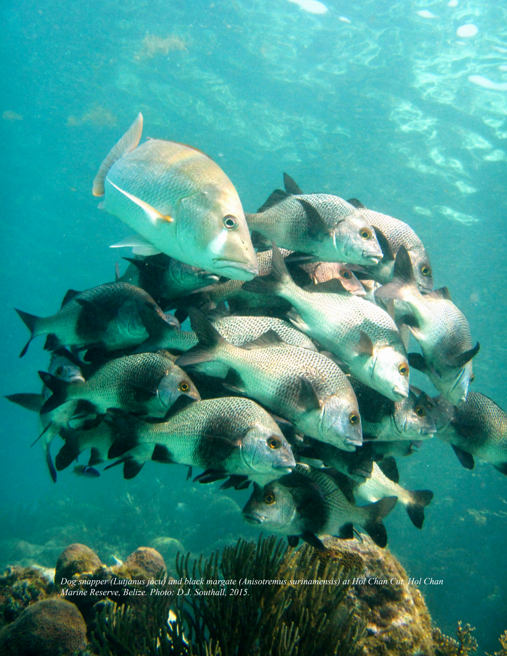
Dog snapper (Lutjanus jocu) and black margate (Anisotremus surinamensis) at Hol Chan Cut, Hol Chan Marine Reserve, Belize. Photo: D.J. Southall, 2015.