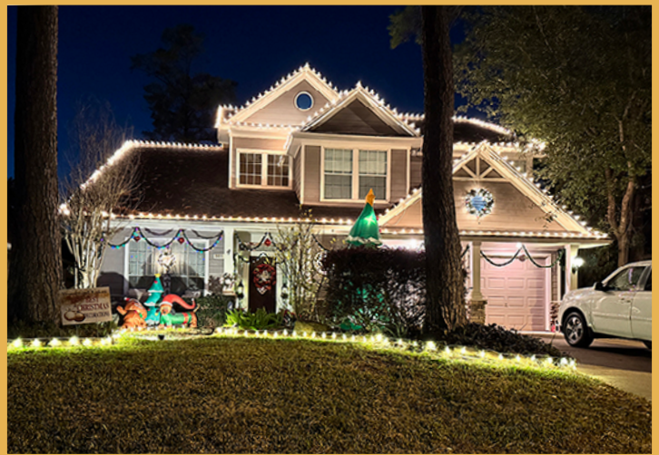
9411 ORATORIO COURT