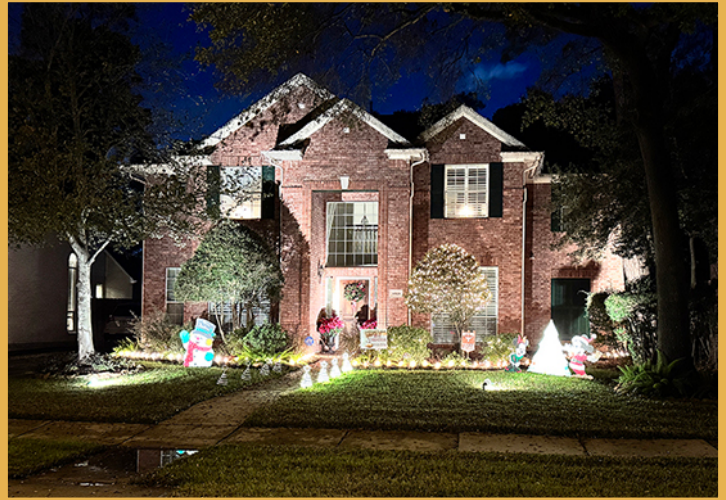
8918 ANDANTE DRIVE