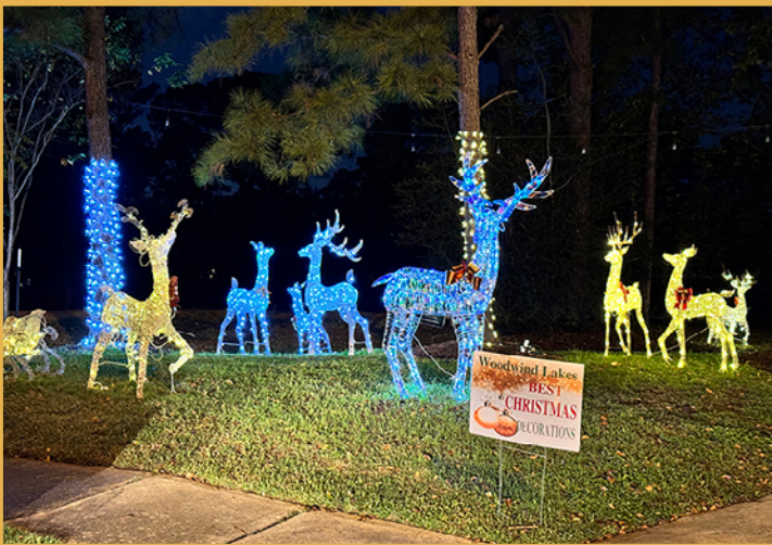
8746 SERENADE LANE