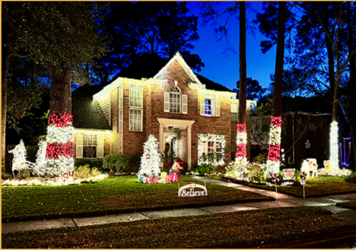
9207 BRAHMS LANE