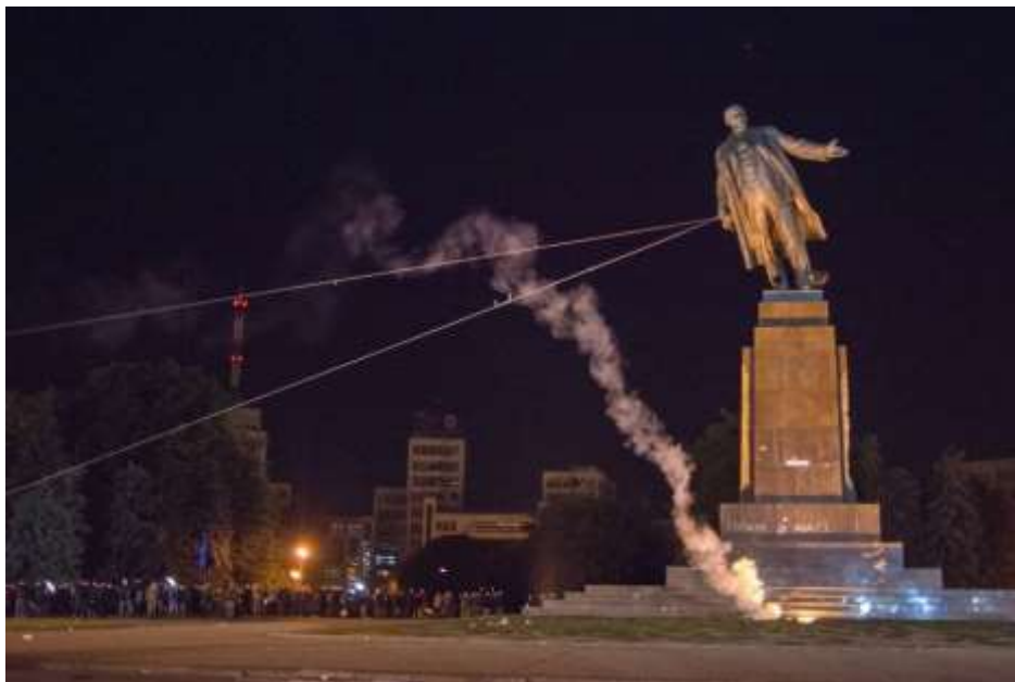
Lenin Finally Topples