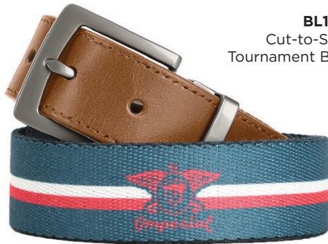
BL105 Cut-to-Size Tournament Belt

36 pc minimum opening order quantity per layout $44 / pc | Domestic production only Program starts shipping 4/24/23