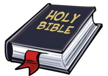
2 Timothy 2:15