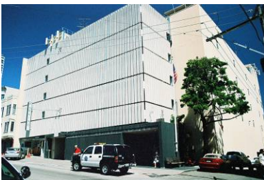
Vallejo Street Parking Garage/San Francisco Police Department Central Station, 766 Vallejo (at Emery)

Cross Broadway and continue north on Powell one block to Vallejo. Cross to the northeast corner of Powell and Vallejo. Turn right on Vallejo and walk a few steps to the Vallejo Street parking garage/San Francisco Police Department Central Station.