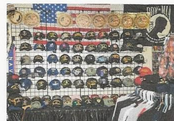
Ft Harrison Bunker Store