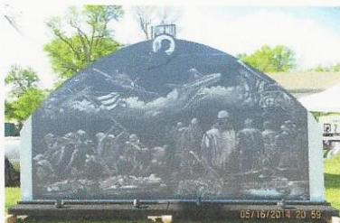
Hoosier POW/MIA Memorial Wall