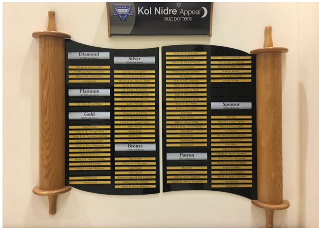
Additional donors to our Kol Nidre Appeal: