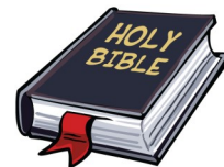
2 Timothy 2:15