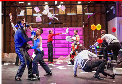
The Glory of the World by Charles Mee at the 2015 Humana Festival of New American Plays.

is the leading event of its kind, launching new plays into the national spotlight! Catch groundbreaking works that represent many generations, many voices and many views. Combined with world-class design and performances, this celebration of American playwrights' innovation and imagination has something for everyone.