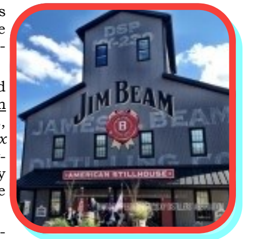
Jim Beam Still House Tour & Bourbon Tasting in Clermont, KY.

Participation on this exciting tour is limited to 50 lucky participants. The tour cost will be available on the registration form. You must reserve and pay for your spot when you register for CAVORT 2016. Availability is provided on a first-come, first-served basis on date of receipt and paid registration.