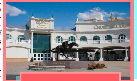
Kentucky Derby Museum

The Kentucky Derby Museum , located at Churchill Downs, is a 12 minute drive from The Galt House. Bus transportation will be provided from the hotel, to "the backside" of Churchill Downs for an exclusive Backside Breakfast Tour starting at 8:30 A.M. Breakfast will be served in the Track Kitchen, which is not open to the public. Breakfast will include the opportunity to watch horses during their morning workout. A tour of the Kentucky Derby Museum will follow. The museum's exhibits might not instill the "racing bug" but it is impossible not to be impressed with the beautiful horses that have such history with Kentucky and Churchill Downs in particular.