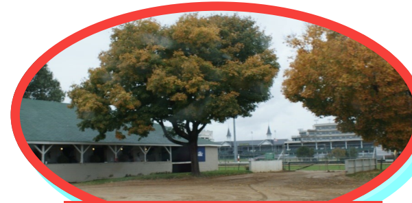
Churchill Downs Backside Tour

The Derby Museum tour will conclude in time to continue on to the next attraction, a visit to the brand new Jim Beam Distillery Visitor's Center in Clermont, Kentucky. As you will notice during your stay, Kentucky has become the bourbon mecca of the country, with many visitors coming to travel the Bourbon Trail. Our trip is 25 miles from Churchill Downs and the comfortable bus ride will give us an opportunity to relax and enjoy the lovely scenery. A box lunch, with drinks, will be provided with your tour reservation. The Jim Beam tour will start at 1:00 P.M. and ends 90 minutes later