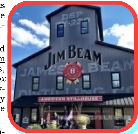
Jim Beam Still House Tour & Bourbon Tasting in Clermont, KY.

Participation on this exciting tour is limited to 50 lucky participants. The tour cost will be available on the registration form. You must reserve and pay for your spot when you register for CAVORT 2016. Availability is provided on a first-come, first-served basis on date of receipt and paid registration.