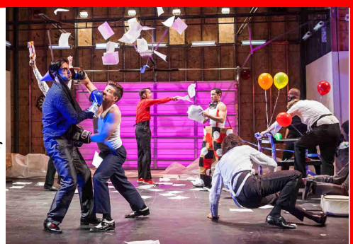
The Glory of the World by Charles Mee at the 2015 Humana Festival of New American Plays.

Generously supported by the Humana Foundation, the Humana Festival is an internationally acclaimed event that has introduced more than