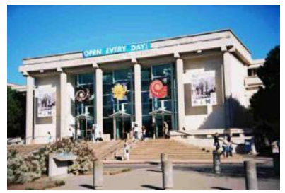
the scene was filmed.

California Academy of Sciences, 55 Music Concourse Drive