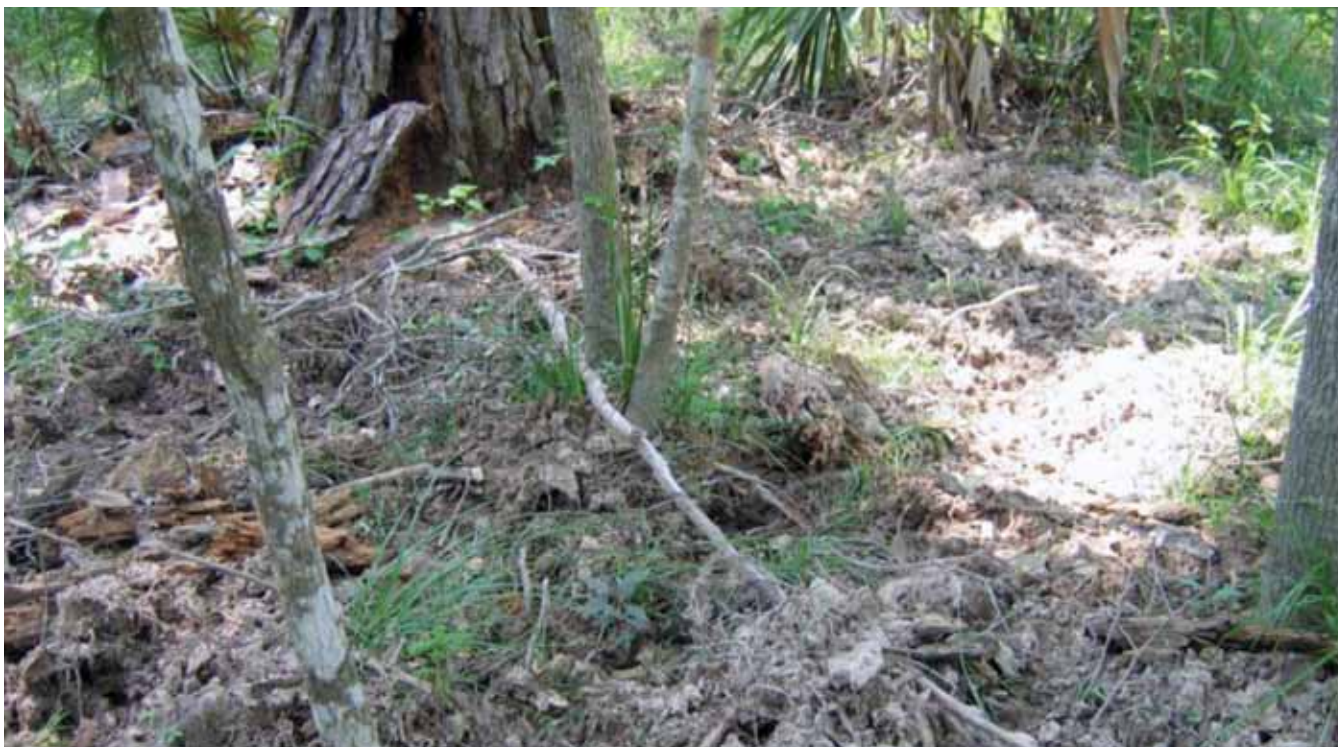
Figure 9. In unfenced plots, there was significantly more bare ground and graminoid cover than in fenced plots.