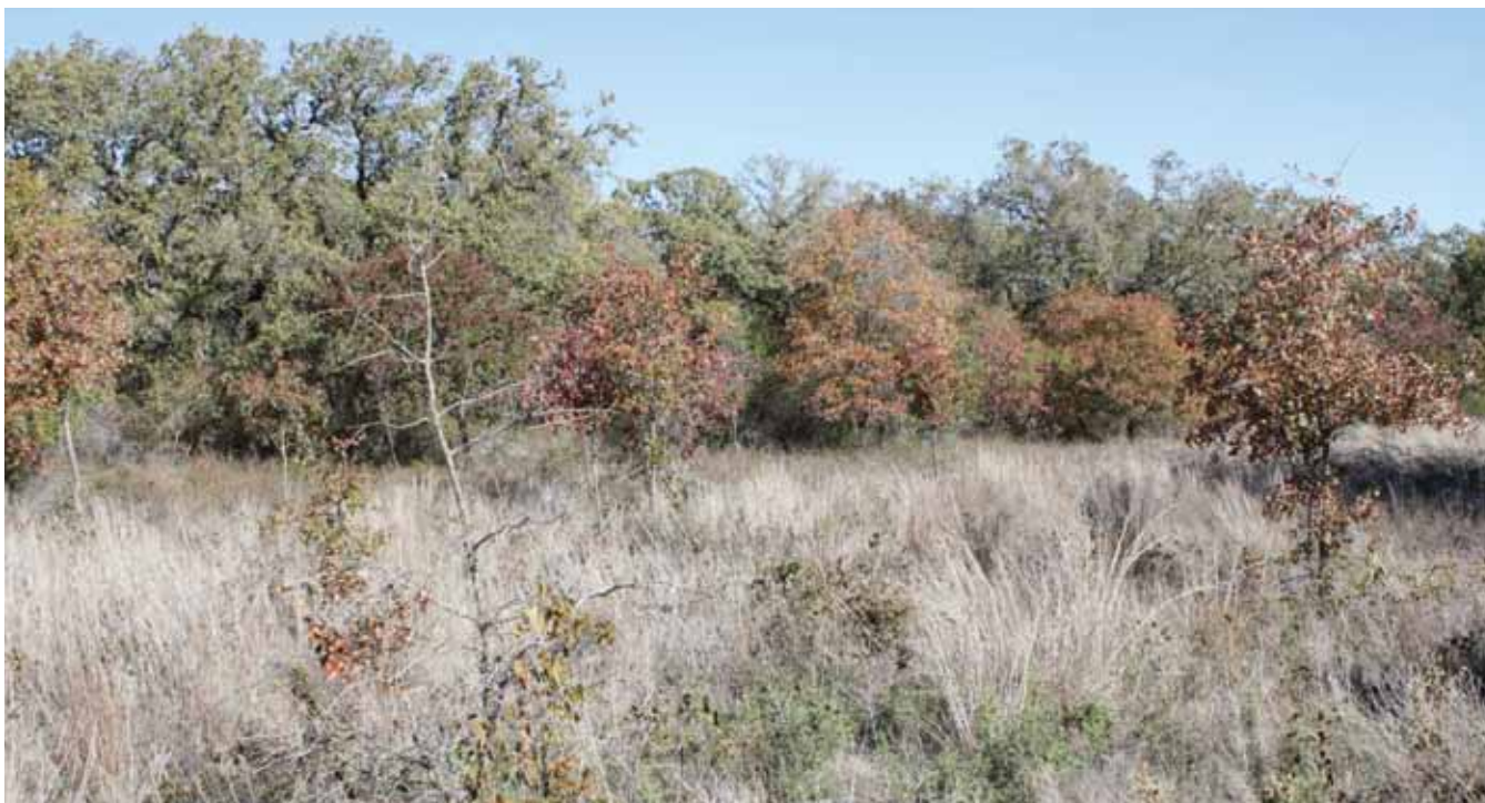
Figure 2. Oak and hickory trees are a major component of ecosystems in much of Texas and provide habitat for many wildlife species.