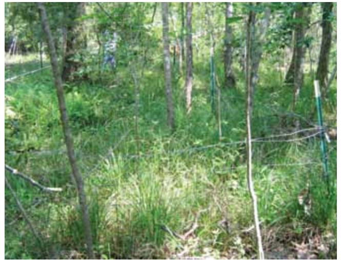
Figure 8. In fenced plots, there was significantly higher forb and woody cover and litter compared to unfenced plots.

or shade (Rogers and Siemann, 2002), has very high drought and flooding tolerances (Butterfield et al. 2004), responds positively to increases of nitrogen (Siemann and Rogers, 2007), and is highly tolerant to herbivory damage (Zou et al. 2008; Figure 6A, 6B). Feral hog rooting in the leaf litter and upper soil layers increases nitrogen levels in the soil by accelerating litter breakdown and may negatively impact soil organisms that inhibit the growth of Chinese tallow (sensu Nijjer et al. 2007). Chinese tallow has already altered many ecosystems in the southeastern U.S. by outcompeting native plants. In some areas like the Gulf Coastal Plains of Texas, Chinese tallow dominates the plant community, which is detrimental to many wildlife species, including grassland birds and waterfowl (Figure 7).