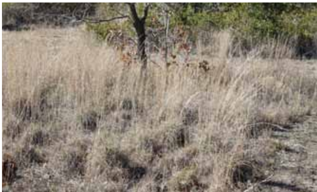
Figure 10. Native grasses, such as Little Bluestem ( Schizachyrium scoparium ), are important as they provide cover for bird species, such as quail, and allow water to infiltrate.

As feral hog populations increase, impacts on the different ecosystems occupied by these animals will also increase, particularly in environmentally sensitive areas. As water quality concerns escalate, it is important to recognize how a non-native species like feral hogs degrade plant communities and water sources.