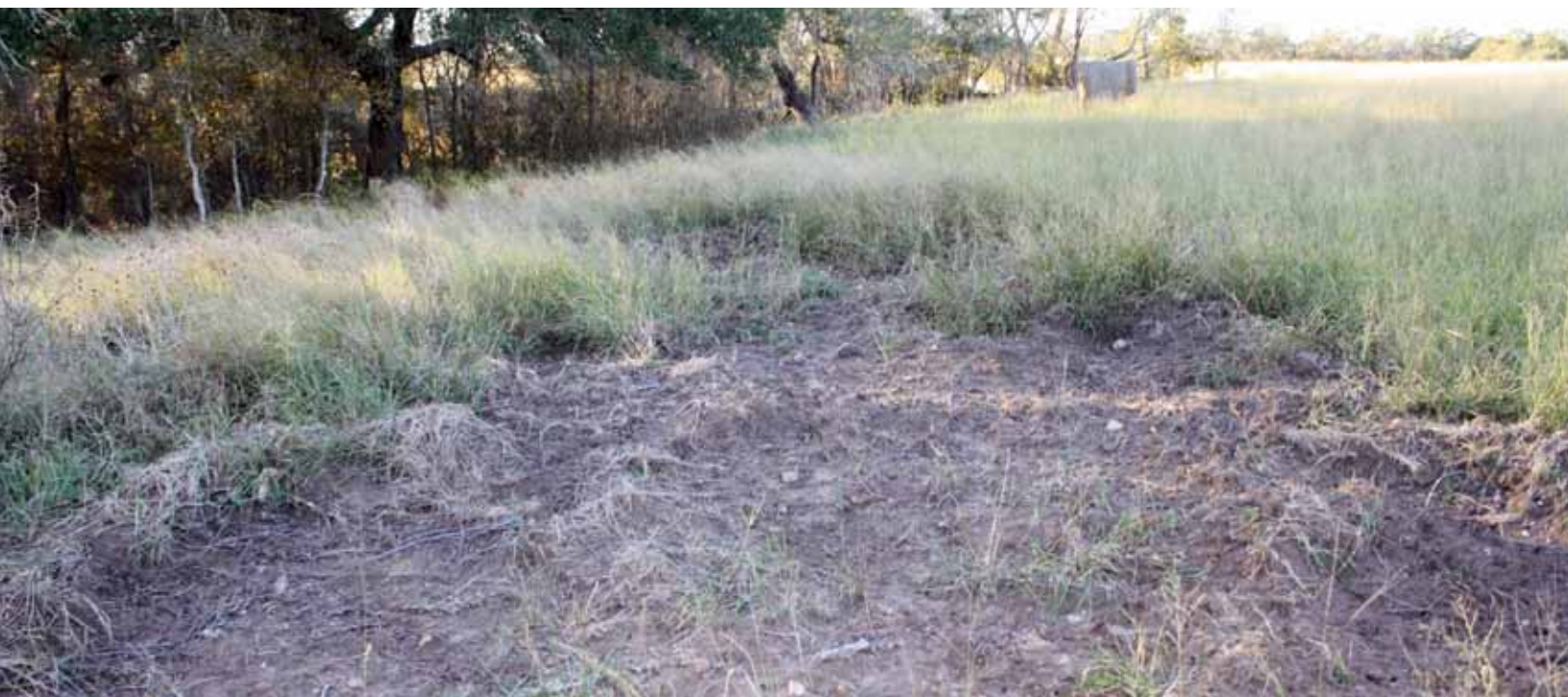
Figure 1. Feral hogs can cause significant ecological damage by their rooting habits that turn over the soil, damaging plant communities and possibly leading to greater erosion.