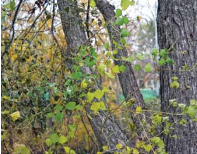
Figure 6A. Chinese tallow ( Triadica sebifera ) leaves.