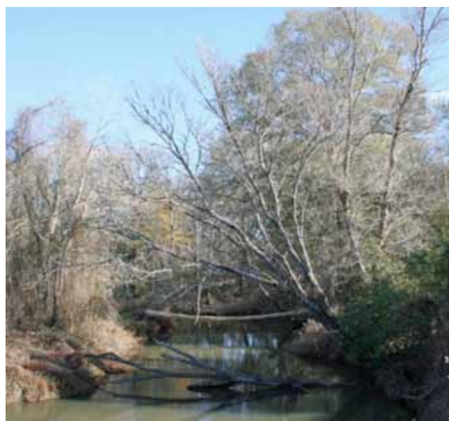
Figure 3. Healthy riparian areas consist of native grasses, forbs, shrubs, and trees that reduce floodwater velocities, thereby inhibiting excess erosion and allowing greater infiltration.

Oak ( Quercus sp. ) and hickory ( Carya sp. ) trees are among the most ecologically important tree species in Texas (Figure 2). These broad-leaved trees produce large seeds, such as acorns and nuts (mast) respectively, which are highly sought after by wildlife for food. Non-native feral hogs compete with native wildlife, such as deer, squirrels, and birds to consume this mast and may have a disproportionate effect on seed abundance and future tree recruitment. Oaks and hickories provide screening, loafing, and escape cover for many wildlife species, and some animals rely on them for nesting, roosting, and foraging. Additionally, timber from these trees is economically valuable and can be used for construction materials and fuel for burning.