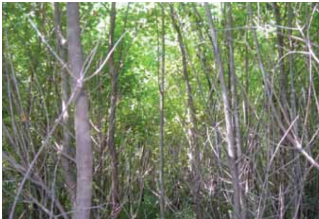
Figure 7. Chinese tallow has rapidly taken over this canopy opening in this forest, thereby excluding all other species.

or shade (Rogers and Siemann, 2002), has very high drought and flooding tolerances (Butterfield et al. 2004), responds positively to increases of nitrogen (Siemann and Rogers, 2007), and is highly tolerant to herbivory damage (Zou et al. 2008; Figure 6A, 6B). Feral hog rooting in the leaf litter and upper soil layers increases nitrogen levels in the soil by accelerating litter breakdown and may negatively impact soil organisms that inhibit the growth of Chinese tallow (sensu Nijjer et al. 2007). Chinese tallow has already altered many ecosystems in the southeastern U.S. by outcompeting native plants. In some areas like the Gulf Coastal Plains of Texas, Chinese tallow dominates the plant community, which is detrimental to many wildlife species, including grassland birds and waterfowl (Figure 7).