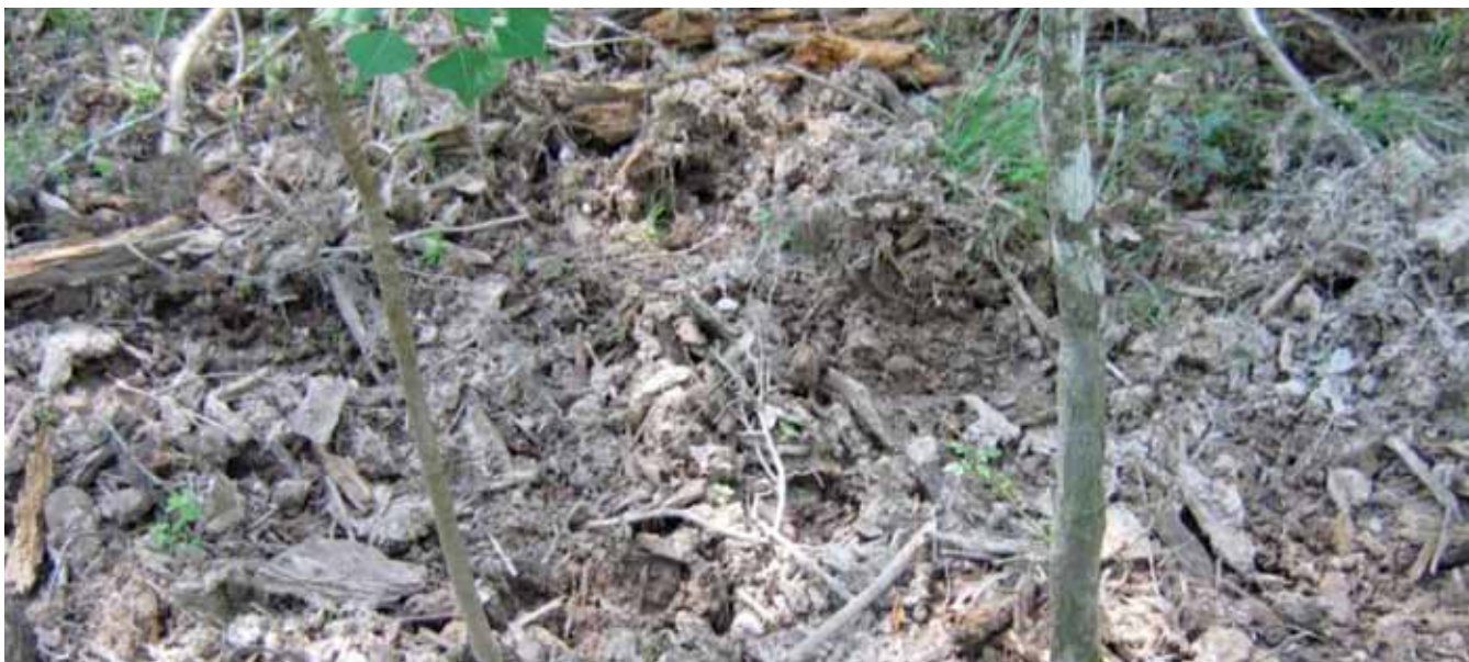
Figure 5. In unfenced plots, there was significantly more bare ground and Chinese tallow was two times more abundant than in fenced plots.