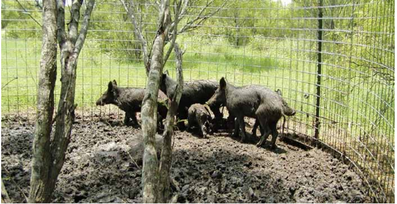
Feral hogs captured in a corral trap

See other feral hog resources at http://agrilifebookstore.org .