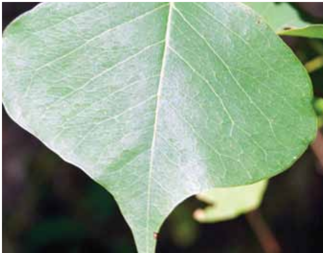
Figure 6B. Chinese tallow leaf.