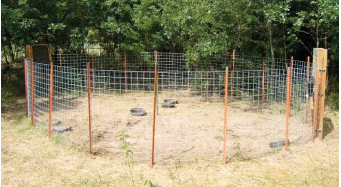
Figure 11. Corral traps are very effective at trapping high numbers of feral hogs at one time.