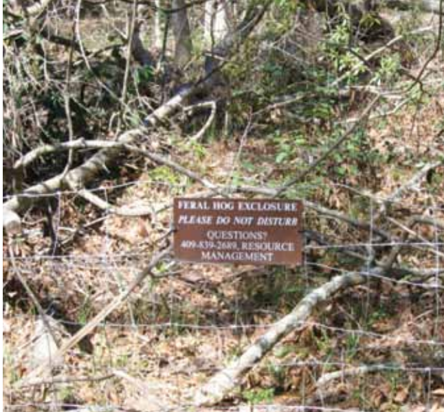
Figure 4. Fenced exclosures were used in this study to evaluate the effects that feral hogs have on this ecosystem.

vegetation is strongly influenced by the presence of water, and is significantly different from upland communities (Wagner, 2003). Feral hogs are known to use riparian areas as travel corridors and the linkage to water and diverse, lush plant life may concentrate feral hog activity in these ecologically important locations. Healthy riparian areas provide many ecosystem services that benefit humans. Examples of these services are: