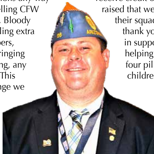
American Legion Child Welfare Foundation PO Box 1055, Indianapolis, IN 46206

would like to offer is: The squadron who has the most members of their squadron show up to the campout meeting will