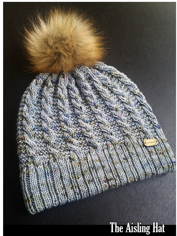
The Aisling Hat

The pattern is available for purchase at the shop or on Ravelry .