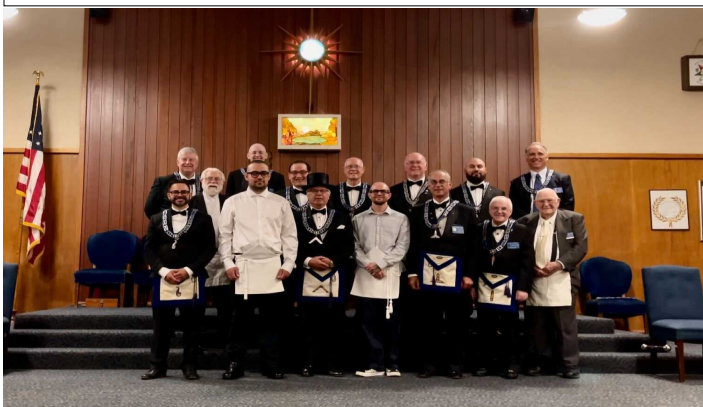
Together in unity - Confidence/Mt Moriah Degree 7/22