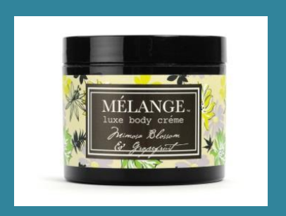
Mimosa Blossom & Grapefruit Fall/Winter Best Seller