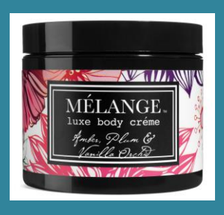
Amber, Plum & Vanilla Orchid Fall/Winter Best Seller