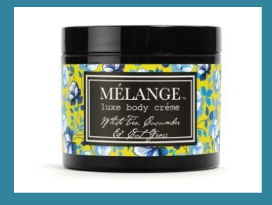
White Tea, Cucumber & Cut Grass