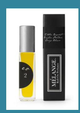
e.o. 2 ITALIAN BERGAMOT BRAZILIAN MANDARIN INDIAN ORANGE BLOSSOM MALAYASIAN YLANG-YLANG