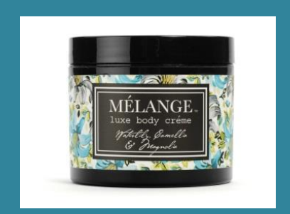
Waterlily, Camellia & Magnolia