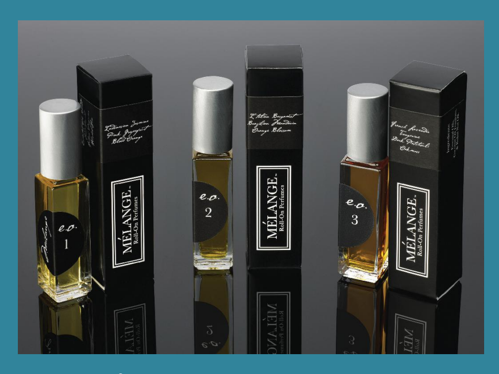
MÉLANGE ROLL-ON PERFUMES ESSENTIAL OIL BLENDS

Three memorable artisan perfumes containing pure essential oils carefully selected from around the world. Hand-poured at our Los Angeles studio, these alcohol free perfumes are prepared in small quantities using a base of natural Coconut Oil fractions, which allow the true beauty of the essential oils to prevail and endure; and antioxidant Kukui nut Oil. Opening Order: $144