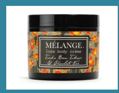
Tonka Bean, Tuberose & Chocolate Fall/Winter Best Seller