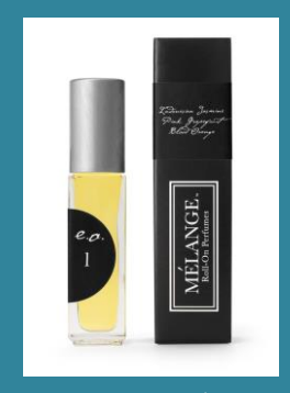
e.o. 1 INDONESIAN JASMINE PINK GRAPEFRUIT & MORO BLOOD ORANGE

Three memorable artisan perfumes containing pure essential oils carefully selected from around the world. Hand-poured at our Los Angeles studio, these alcohol free perfumes are prepared in small quantities using a base of natural Coconut Oil fractions, which allow the true beauty of the essential oils to prevail and endure; and antioxidant Kukui nut Oil. Opening Order: $144